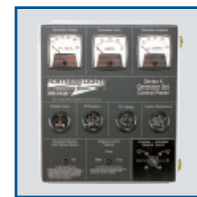
Length - 14" x Height - 17" x Depth - 6.25"

Includes: Engine temperature gauge, DC volt meter, AC voltmeter, AC frequency meter, AC ammeter with harness, oil pressure gauge, start/stop, and shutdown bypass/preheat switch. Available as flush mount or with enclosure (L: 14" x H: 17" x D: 6.25")