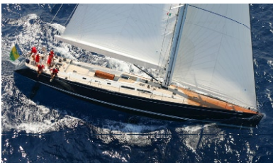
Southern Wind 78'