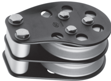
Double cheek block with fasteners