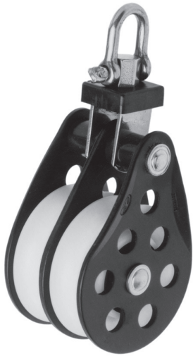
Double with swivel