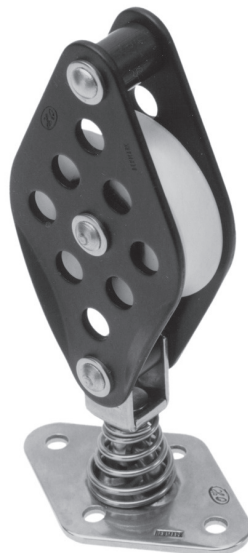
Spring base stand-up block with becket