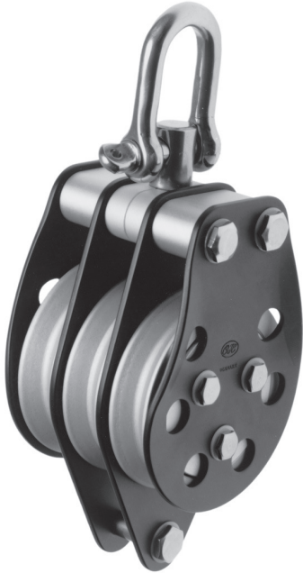
Triple with swivel and becket