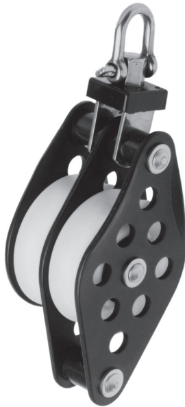
Double with swivel and becket