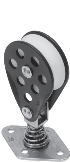
Spring base stand-up block

OH ball bearing blocks are produced with 3 rows of stainless steel ball bearings, which gives the sheave a smoother running and secures a longer lifetime. These blocks are only available in black anodised aluminium with white sheaves.