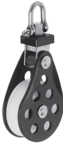
Single with swivel