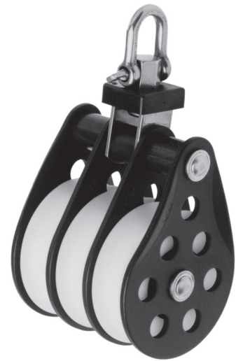
Triple with swivel