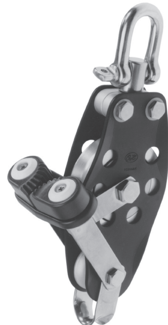
Fiddle with swivel and cam cleat