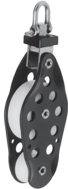
Fiddle with swivel