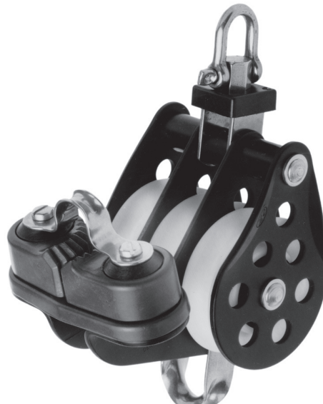
Triple with swivel, becket and cam cleat