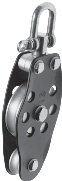
Fiddle with swivel