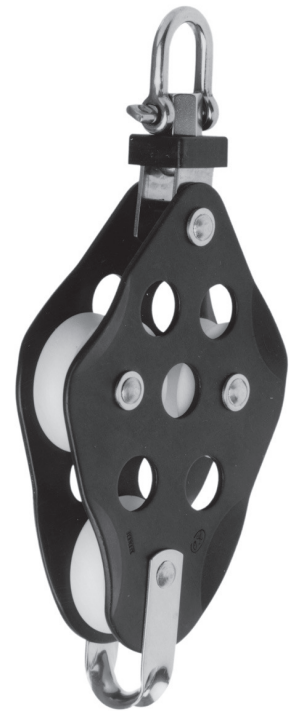
Fiddle with swivel and becket