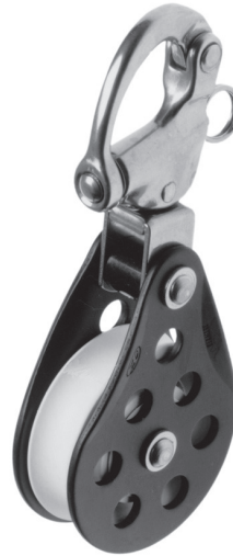
Single with snap shackle