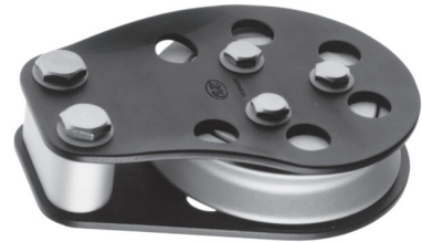
Cheek block with fasteners

Our big boat blocks with ball bearings and aluminium sheaves are produced with a minimum of 3 rows of delrin balls and are only available with black anodised aluminium sides. Blocks with plan bearing delrin sheaves are only available with sides in natural.