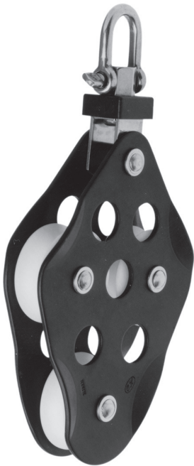
Fiddle with swivel