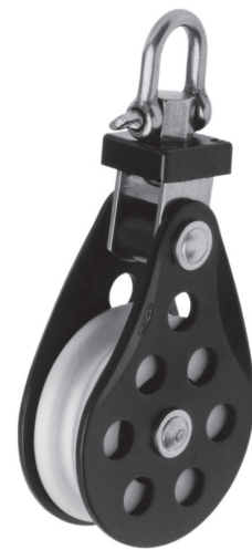
Single with swivel and aluminium sheave for rope and wire