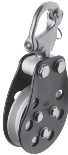
Single with snap shackle