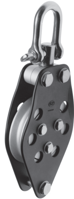
Single with swivel and becket