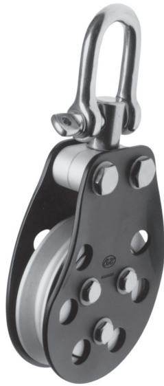
Single with swivel