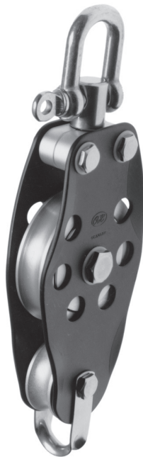
Fiddle with swivel and becket