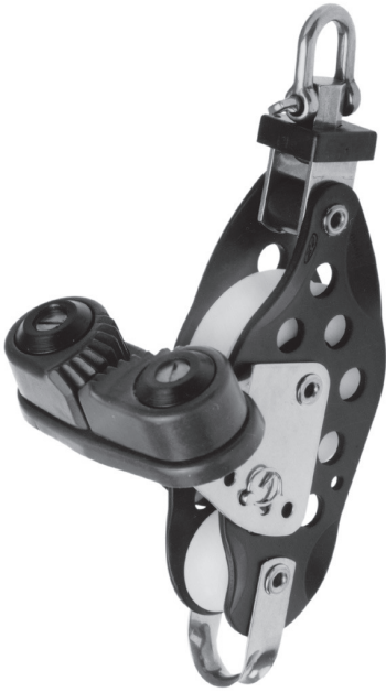
Fiddle with swivel and cam cleat adjustable to 5 positions