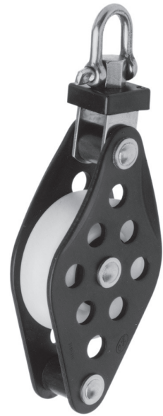
Single with swivel and becket