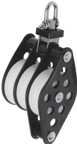
Triple with swivel and becket