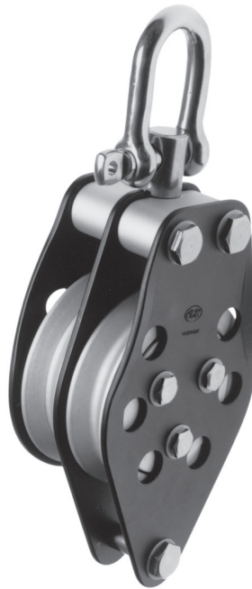
Double with swivel and becket