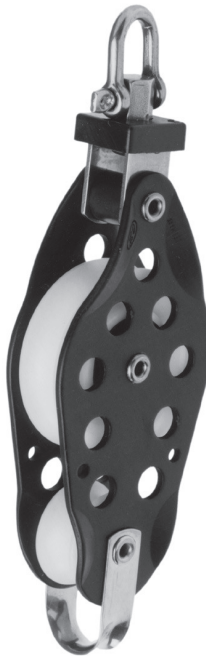
Fiddle with swivel and becket