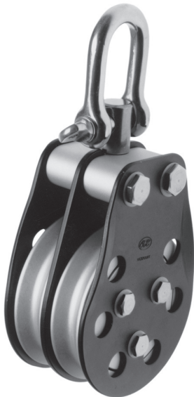
Double with swivel