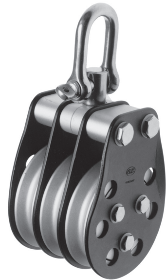
Triple with swivel