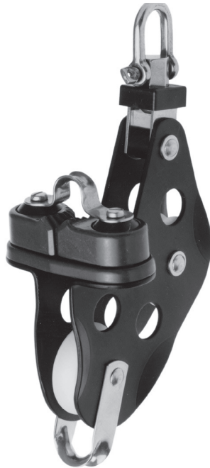
Fiddle with swivel, becket and cam cleat